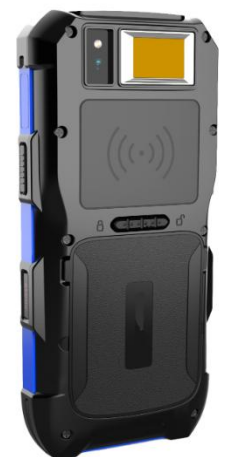
XPID210 Biometric PDA