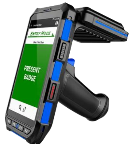
XPID211 Gun Unit