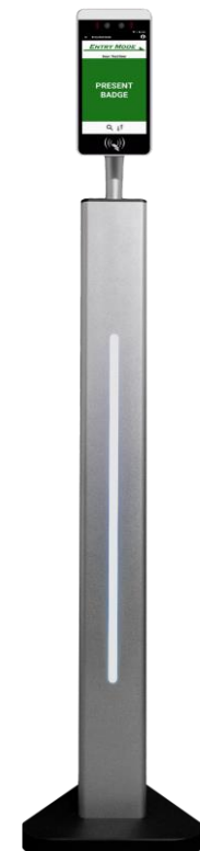
XPIR Standalone Kiosk